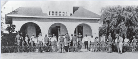
1919 Infirmary in the Schweitzer Building (Site of Current Science & Engineering Library)