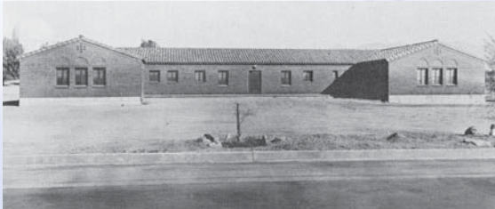
1936 Infirmary on the UA Mall (NW Corner of University & Cherry Ave.)