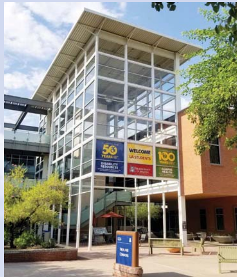
2018 Highland Commons Building (NW of 6th St. & Highland)