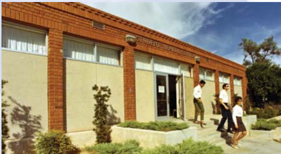
1968 Student Health Center on the UA Mall (NW Corner of University & Cherry Ave.)