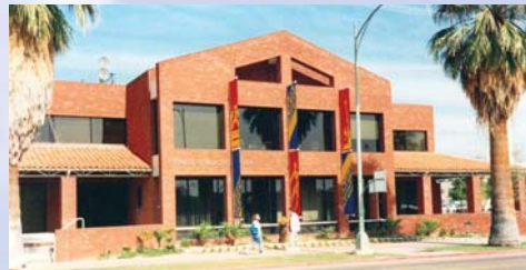
1995 Campus Health Service (New Building Addition, UA Mall)