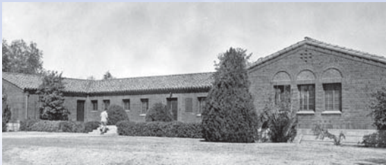
1951 Infirmary on the UA Mall (NW Corner of University & Cherry Ave.)